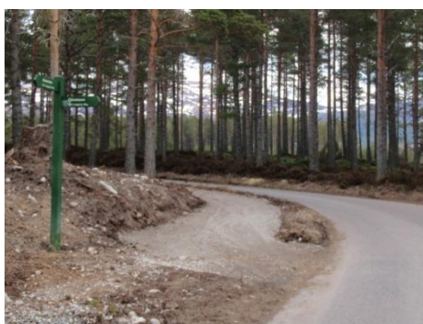
Fig. 3 : start of developed walkway