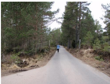
Fig.5 : Section of existing vehicular access route (view from junction with the northern section of the Old Logging Way, looking towards the junction with the public road