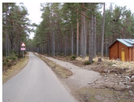
Fig. 4 : end of walkway at Centre